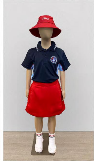
SUMMER CUIOTTES - GIRLS