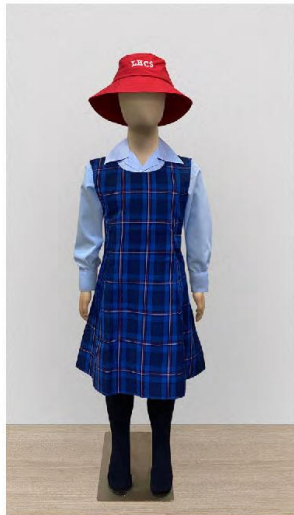
WINTER TUNIC - GIRLS