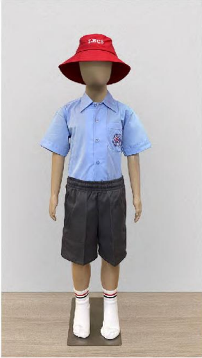
SUMMER - BOYS