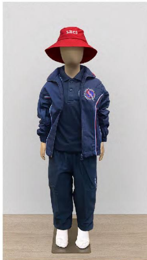
WINTER SPORTS - UNISEX