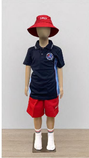
SUMMER SPORTS - UNISEX