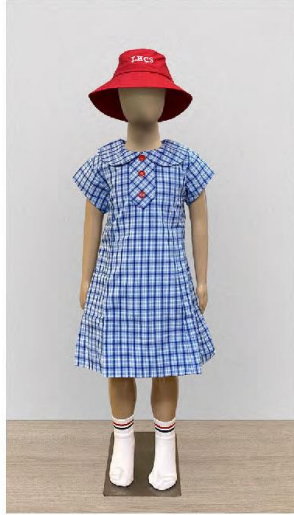
SUMMER DRESS - GIRLS