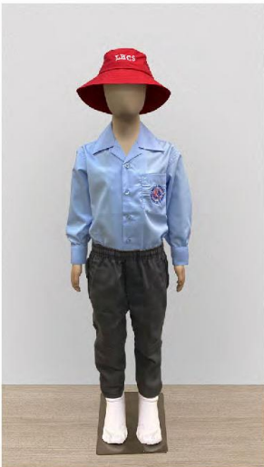
WINTER - BOYS